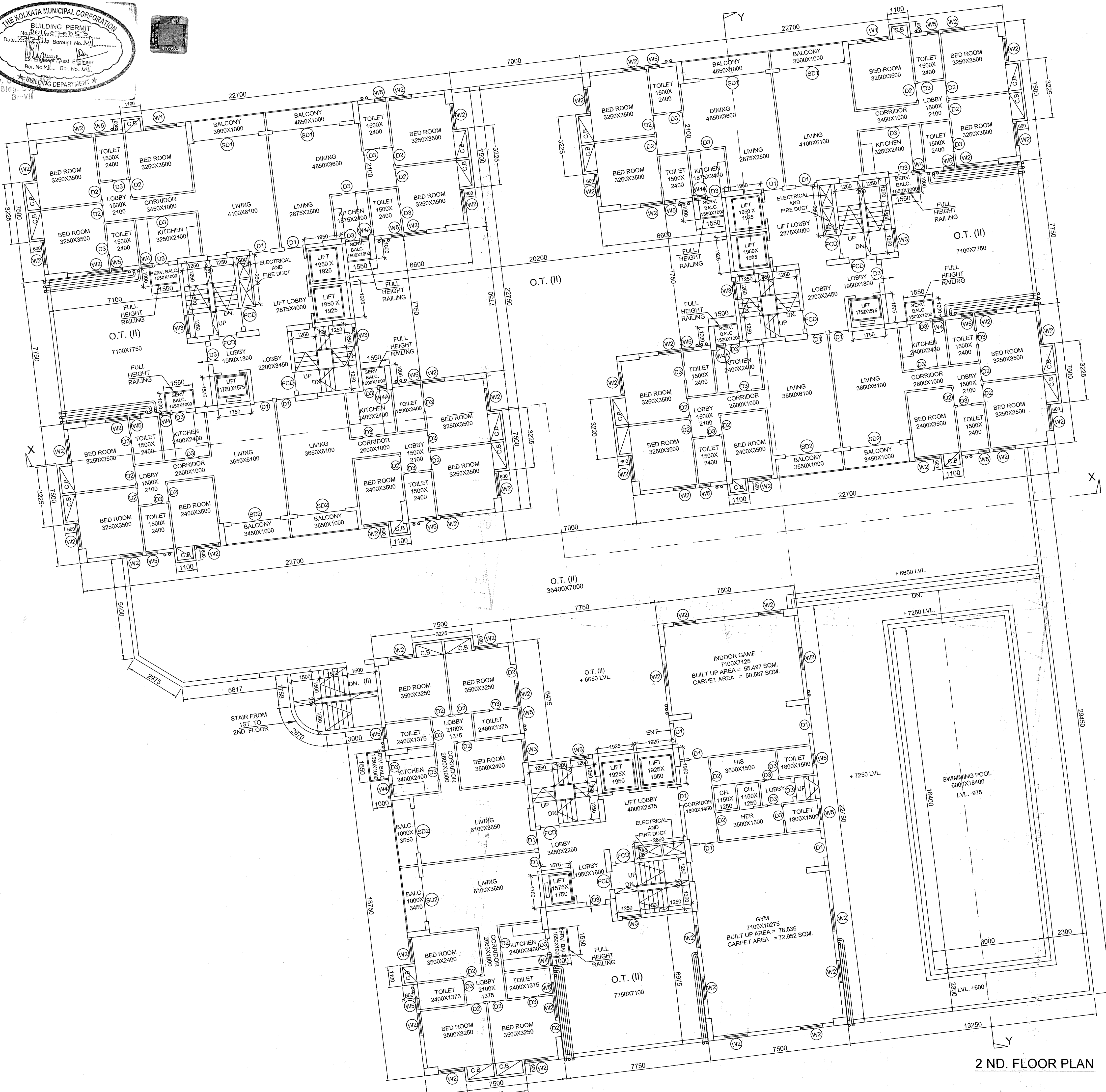
2 ND. FLOOR PLAN